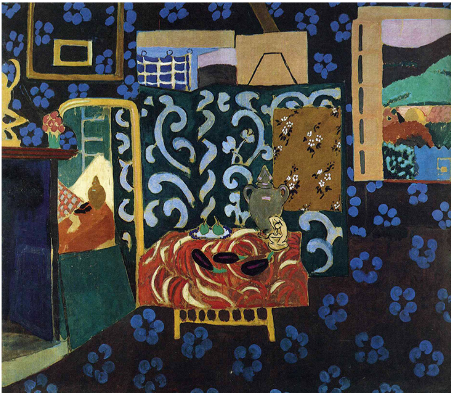
Still Life With Aubergines, 1914

In 1912 Matisse made his first visit to Tangiers, where he was so entranced by the dazzling colours, he came to call the place a “painter’s paradise.” The vivid, entrancing blue of Moroccan sea views infiltrated his paintings, but it was the unmistakable patterns and colours of Moroccan textiles that really fired him up, sparking a lifelong obsession with collecting and painting these richly decorative fabrics. Still Life with Aubergines , 1914 reveals the impact of these dazzling fabrics on his creative practice, as tiny aubergines in the